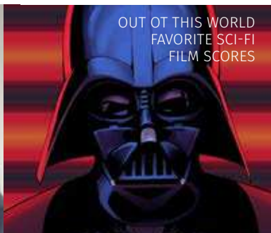
OUT OF THIS WORLD FAVORITE SCI-FI FILM SCORES