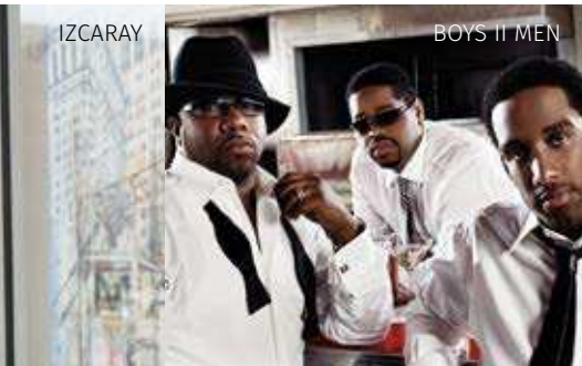
BOYS II MEN