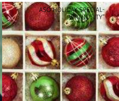
ASO HOLIDAY SPECIAL- "WINTERSHINY"