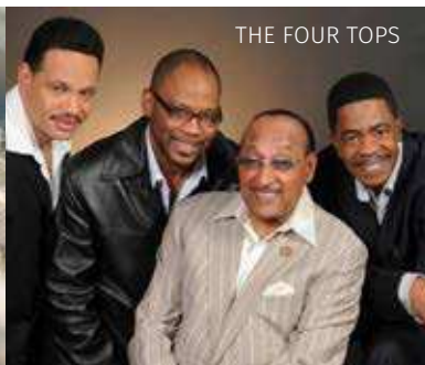
THE FOUR TOPS